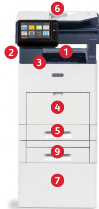
Xerox® VersaLink® B605 Multifunction Printer Print. Copy. Scan. Fax. Email.